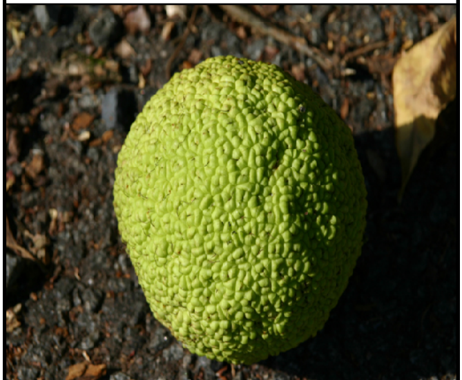
Fruit of the Osage Orange. We do not know if this one has seeds.