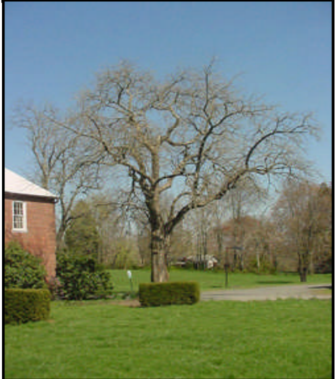
Champion Osage Orange tree located in front of Brentsville Jail